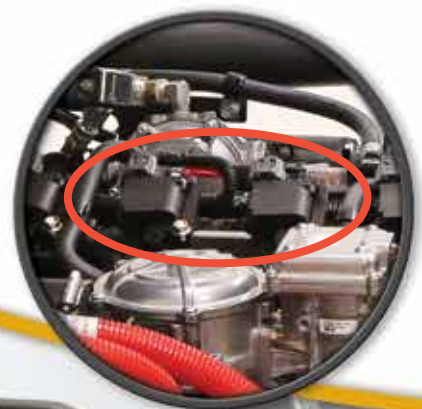
Coil over plug ignition design

The radiator is easy to access. The coolant recovery bottle is easily visible to check coolant levels. A coolant fill neck is located for easy reach.