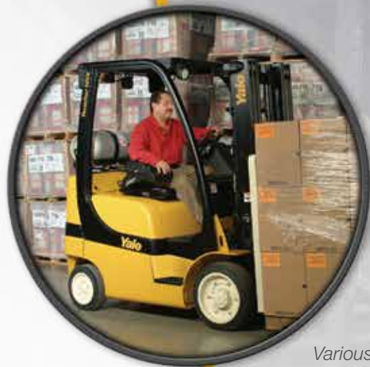
Various truck configurations

The GC040-070VX series of trucks is available in several configurations, designed to meet and exceed your material handling application requirements. The Veracitor® lift truck can be configured for standard, medium and heavy duty applications with state-of-the-art features, enabling superior power for maximum performance. The choices of different configurations allow you to optimize the truck to handle diverse application demands with lowered acquisition cost, and boosting performance while still helping to reduce overall cost of operation.