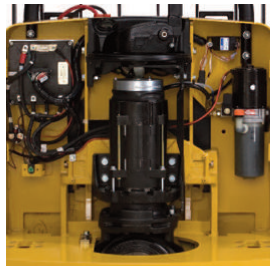
Sealed Wiring Harness Connectors

The Yale MPE060 Series offers the most reliable parts program available in the industry. Yale dealers provide off-the-shelf availability of maintenance and repair parts routinely serviced in the first two years of truck operation.