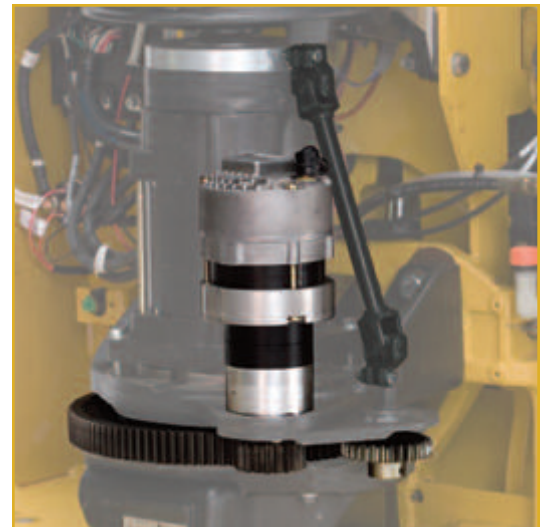
Optional power assist steer motor