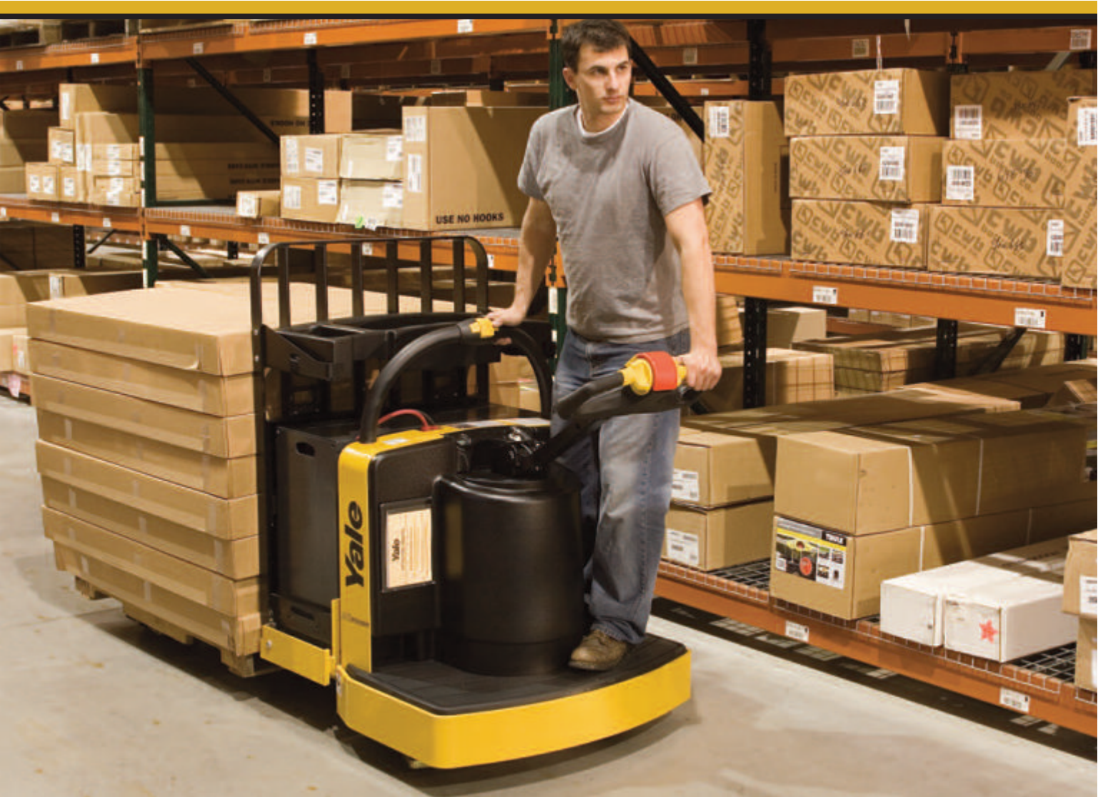
All trucks shown with optional equipment

Operators prefer Yale® trucks. Applying best-in-class ergonomics, the Yale MPE060 Series helps your operators get the job done by reducing fatigue and improving productivity. The ergonomically designed handle puts full control at the operator's fingertips. Lifting, lowering, speed control and the horn are easily accessed regardless of operating position.