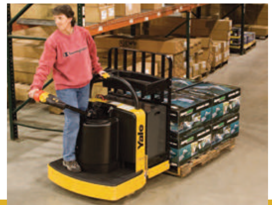
Intuitive fingertip controls