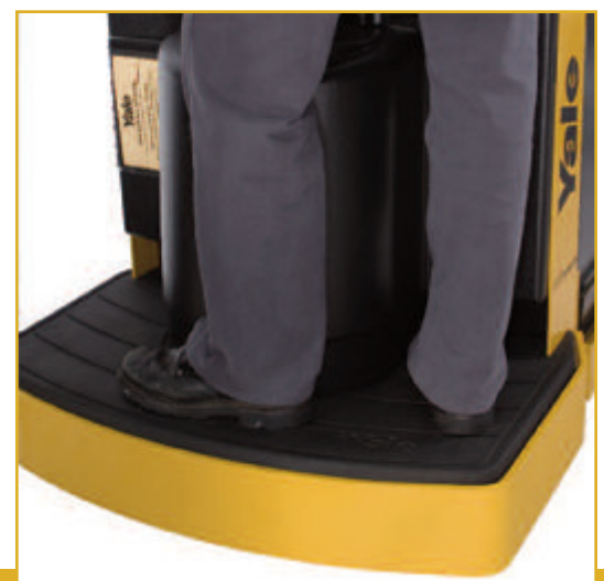
Industry leading foot room