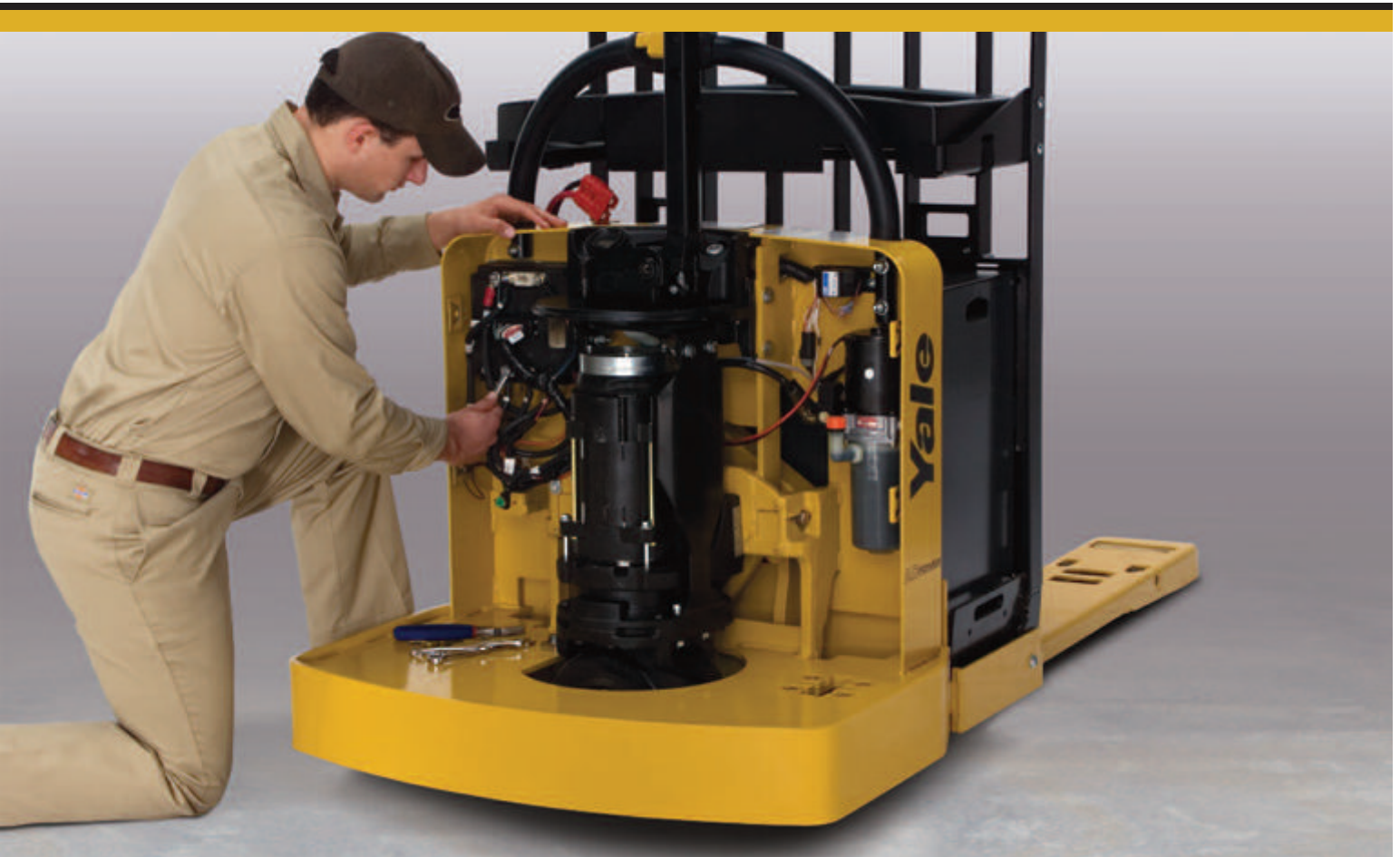
All trucks shown with optional equipment

Not only are Yale MPE060 trucks designed to require less maintenance, they're also designed to be extremely easy to service. From the easy-to-remove compartment cover, to the easy access to vital components, these trucks are designed with the smallest service details in mind. But there's nothing small about the service access these trucks provide. Yale's dedication to providing maximum access makes servicing fast, easy and convenient. It's the new standard in truck serviceability—only from Yale.