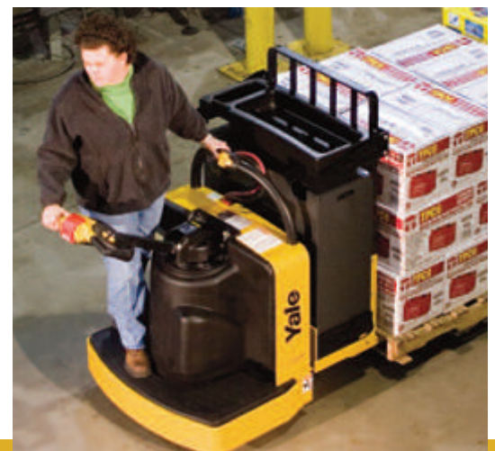
Optional power assist steering

The MPE series has an optional power assist steer feature that significantly reduces operator steer effort and increases maneuverability. This results in reduced operator fatigue. This advanced system automatically provides the proper amount of assist based on handle position, steer angle, and truck travel speed.