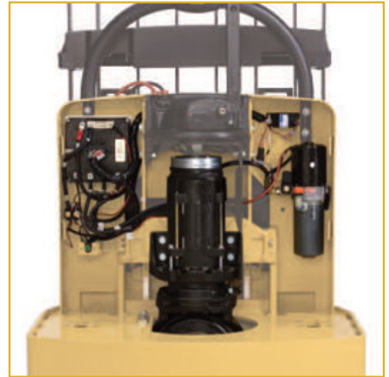
Excellent service access

The truck's compartment cover is made out of a custom thermal plastic material that is exceptionally rugged. It is attached with spring clips and is easily removed without tools.