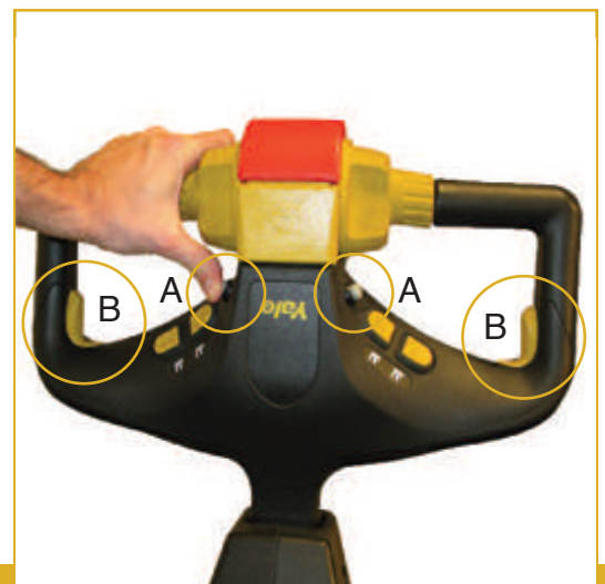
Optional Smart Coast Control (A) with Pick Assist (B)