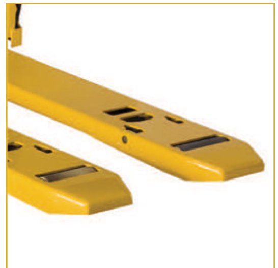
Tapered fork design