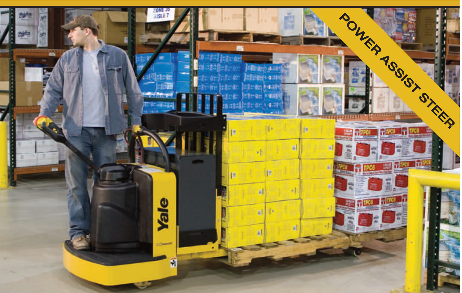
All trucks shown with optional equipment

As a leader in materials handling, Yale® offers so much more than the most complete line of lift trucks. Yale has invested heavily in people, processes and capital equipment to encompass all the cornerstones of productivity and dependability... Innovative Design, Comprehensive Testing, Highest Quality, Advanced Components and Superior Manufacturing.