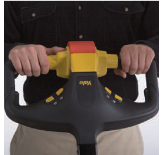
Ergonomically designed control handle

The ergonomically designed platform enables the operator to stand and operate the truck from either the left or right hand side. Recessed “pocket areas” in the motor compartment cover provide industry-leading foot room on the operator platform. A standard cushioned rubber floor mat with tapered edges provides excellent operator comfort. The cushion is easily removed for cleaning and service access.