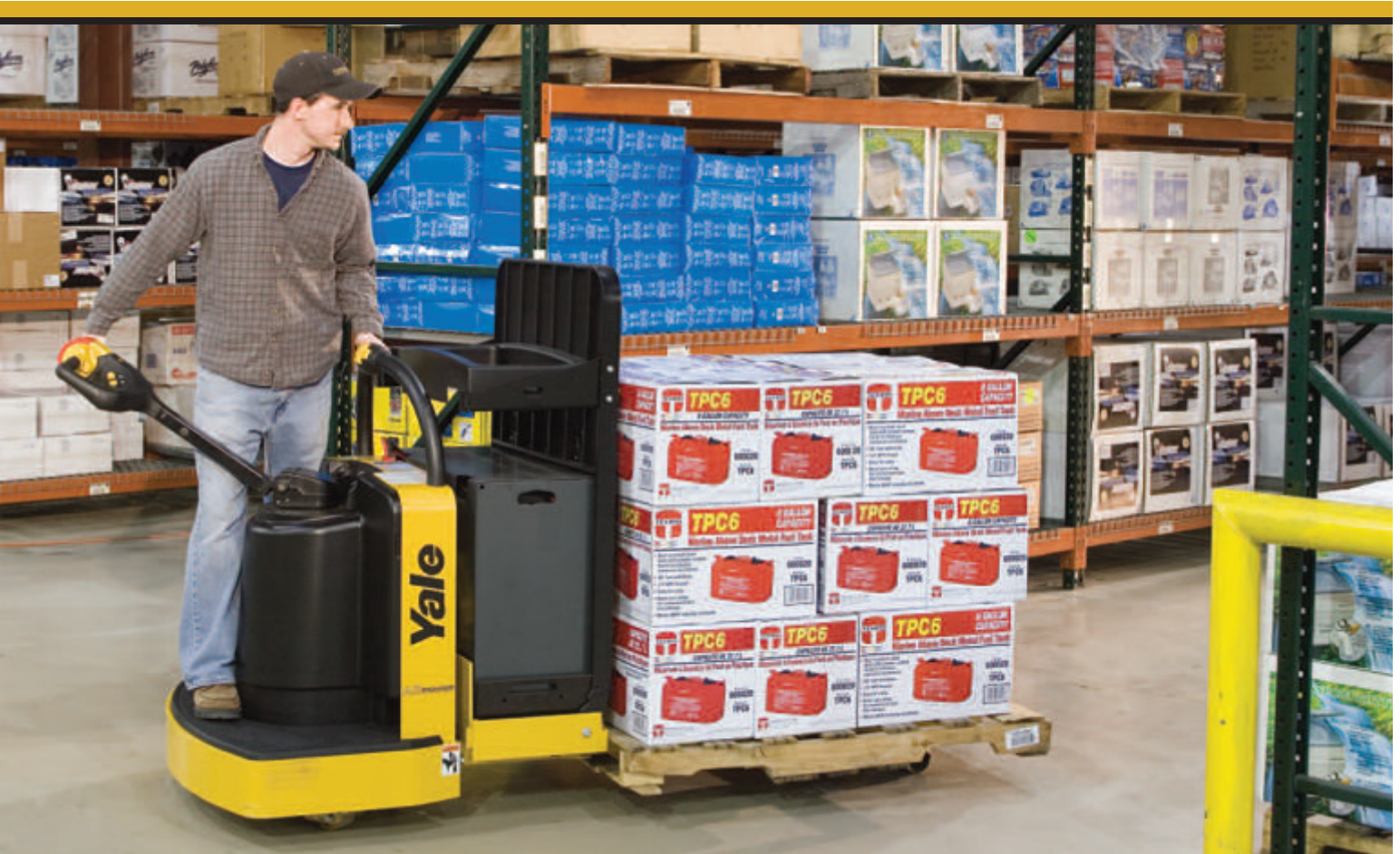
All trucks shown with optional equipment

Performance and productivity are built into every Yale® truck. The MPE060 Series is no exception. From their AC motor technology, high performance hydraulic system and integral lift pump motor control, these trucks are designed with state-of-the-art technology that adds up to reliable performance.