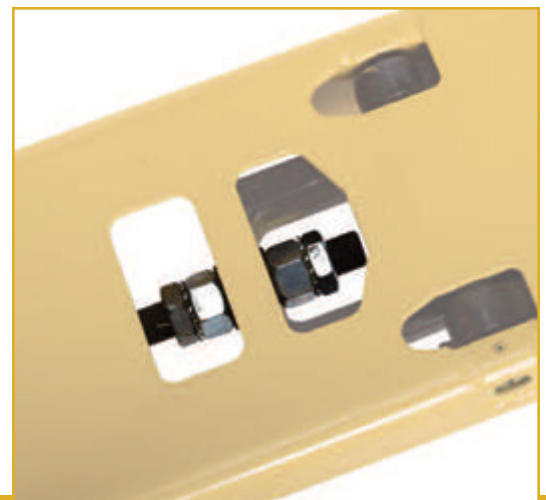
Easy to adjust lift linkage