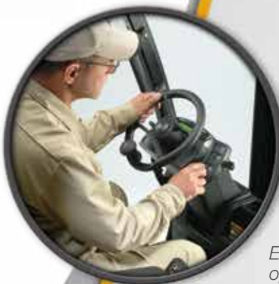
Excellent operator comfort